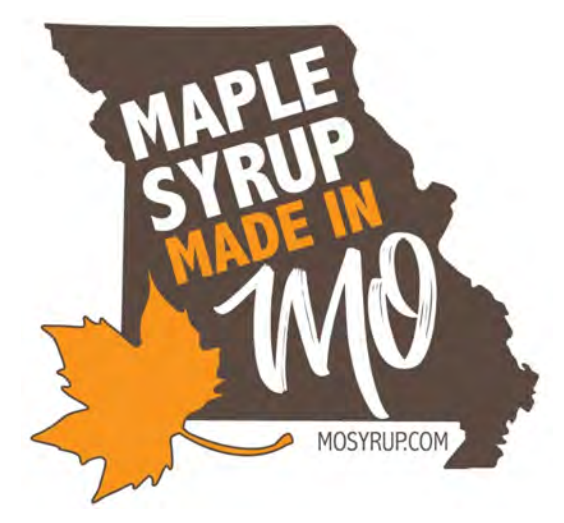
Figure 5. Example "Made in Missouri" maple syrup logo. Developed by the Missouri Maple Syrup Initiative.

Value-added agricultural producers who are interested in selling directly to consumers should consider the market for their product carefully. Four marketing principles: product, price, place and promotion are the fundamental components to building a marketing plan for a product. This guide is designed to aid maple and other tree syrup producers or entrepreneurs to improve or build their marketing efforts. Missouri's tree syrup industry shows recent growth and strong prices within the state suggest the industry can continue to expand.