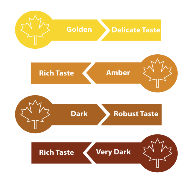
Figure 3. USDA maple syrup grade A color and taste classes. Developed by the International Maple Syrup Institute.

Early-season syrup, lighter in color and more subtle in flavoring, is associated with sap gathered in early winter.