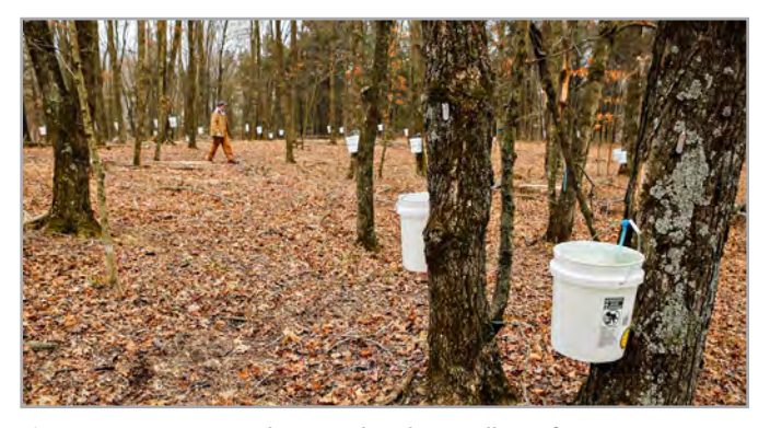
Figure 1. Survey respondents produced 480 gallons of syrup in 2022.

This guide aims to assist existing and new treesugaring enthusiasts with an interest in selling locallymade syrup by covering the basics of product marketing. The guide is structured around four marketing principles: product, pricing, place and promotion.