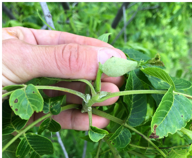
Pistillate flowers are pollinated when the ovule begins to swell, and the stigmas turn brown/black. Fungicides for season-long anthracnose control may be applied at this stage.