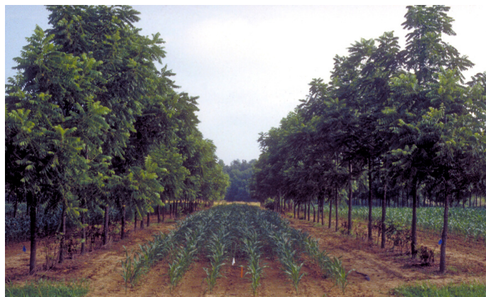
Black walnut and corn alley cropping

For ideas on marketing and guidelines for budgeting a black walnut orchard, contact the UMCA at blackwalnut@missouri.edu . The UMCA offers additional information on marketing specialty crops and has designed an Agroforestry Black Walnut Financial Model to assist with decisions including tree spacing, nut harvest and whether to use improved (grafted) or unimproved trees. This convenient spreadsheet tool will help make estimates about future nut production and tree diameters. Visit centerforagroforestry.org to access more information.