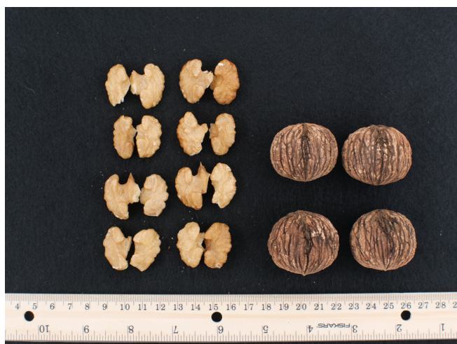
Black walnut nut meat and shells