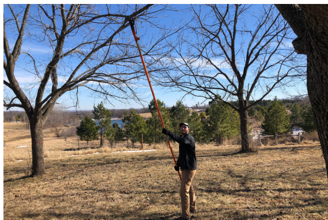
An extendable pole saw, or pole pruner may be used to remove low-hanging, water sprouts, broken, weak, or diseased branches during dormant winter pruning in a mature black walnut orchard.

Pruning Mature Trees Pruning should be done during winter while the trees are dormant. Dormant winter pruning will promote new growth, while summer pruning will inhibit growth. Careful pruning during the establishment of the orchard will lead to the development of desirable canopy structure of the trees, while pruning at bearing age will help maintain that structure and promote nut production (see right image). Pruning bearing trees can also help to facilitate mechanical harvest. Prune mature trees to remove low hanging, broken, weak, or diseased branches, as well as eliminate any water sprouts. Remove branches that are crossing or rubbing together. Every time you prune walnut trees (dormant or summer pruning), look to correct tree structural problems. If a branch has formed a narrow crotch at the point of connection with the trunk, remove the entire branch to eliminate future problems with limb breakage. The goal is to promote two or three well-spaced lateral branches that are oriented evenly around the trunk and staggered with respect to those below them to create a well-balanced crown. Avoid cutting branches that are greater in size than one-third of the main trunk. It is not recommended to paint cut wounds.