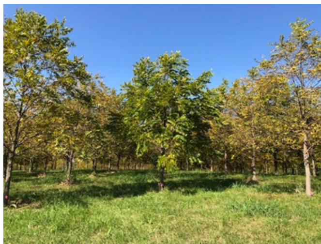
Green, anthracnose resistant tree (center) surrounded by yellowing, partially defoliated anthracnose susceptible trees in late summer.

see bottom right image). Timing of this application is critical, so cultivar differences in flowering date must be considered. The earliest flowering trees may require a second fungicide application 10 to 14 days after the first spray. During an unusually wet spring, additional fungicide applications may also be necessary.