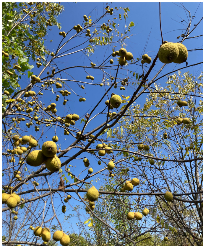
Nuts maturing on the limb of a black walnut tree

Reid, W., M.V. Coggeshall, and K.L. Hunt. 2005. Black walnut cultivars for nut production. Walnut Council Bulletin 32(3):1,3,5,12,15. Schlesinger, R.T., and D.T. Funk. Managers Handbook for Black Walnut. USDA Forest Service. http://nrs.fs.fed.us/pubs/103