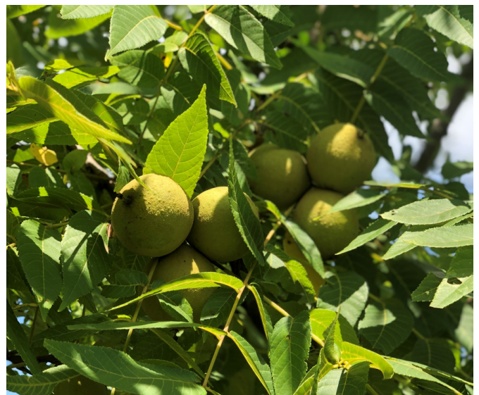
Nut clusters on a mature black walnut tree

trees can be maintained using herbicides and/or the application of wood chip mulch. Do not use hay or grass clippings to mulch your trees, as these types of "soft" mulches can provide an excellent shelter for tree-gnawing rodents. Planting a cool season perennial, low-growing grass that can tolerate frequent mowing is recommended to conserve moisture between tree rows.