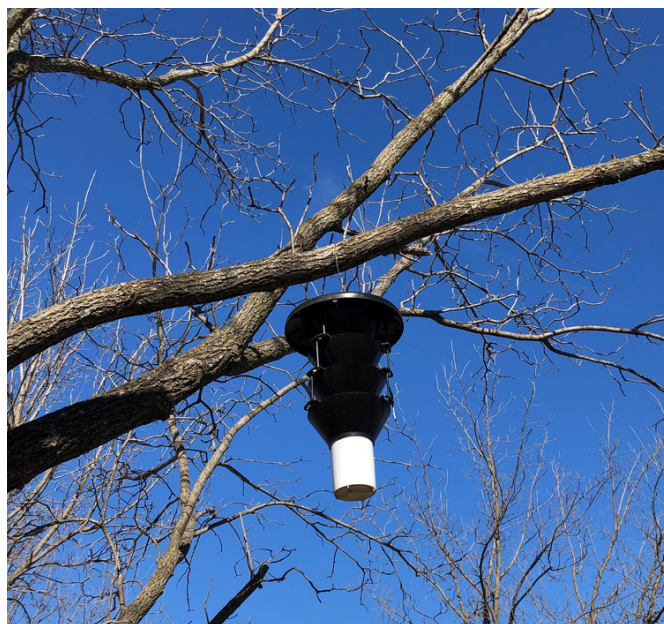
This trunk-mounted cone trap is used to monitor walnut curculio activity.

fungicides can be combined in the same sprayer to be applied during the critical spray window after pollination. Trunk-mounted cone traps should be used to monitor any additional curculio activity following the first insecticide application (see image below). A second insecticide treatment may be necessary if traps indicate significant curculio populations.